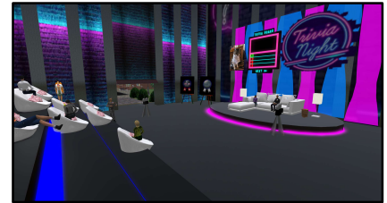
Trivia Night continues to be well attended and a popular Autus@Night event.